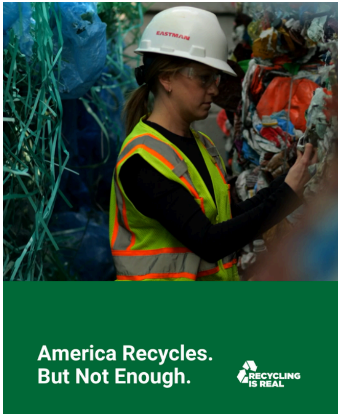
STANDARD INSTAGRAM POST (1080X1350)