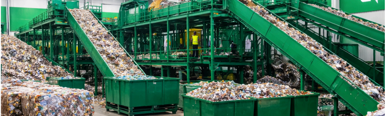
STANDARD LINKEDIN BANNER (1584X396)